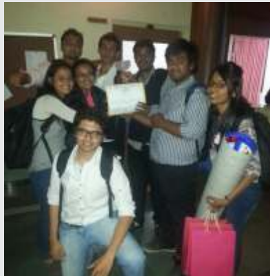
1st Prize in Role Camera Action Cut at Vividha - National Meet organised by Christ College Rajkot