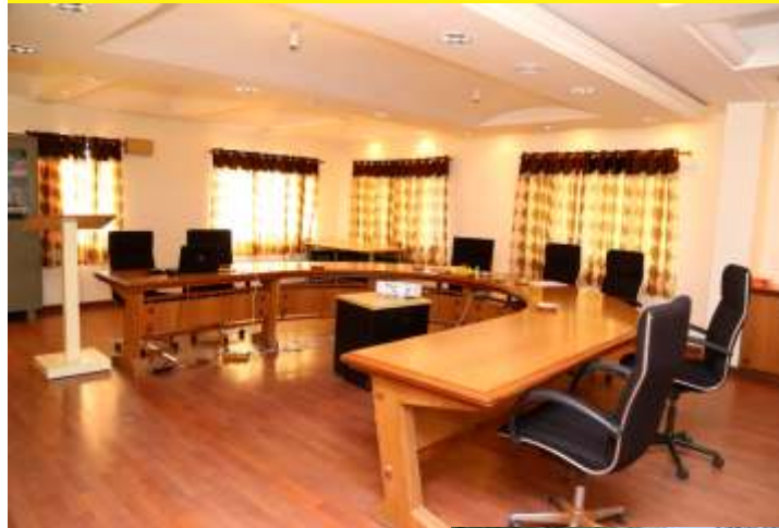
Well Equipped Seminar Hall