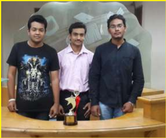
1st runner up trophy at Knowledge Quest organised by CPIBA.