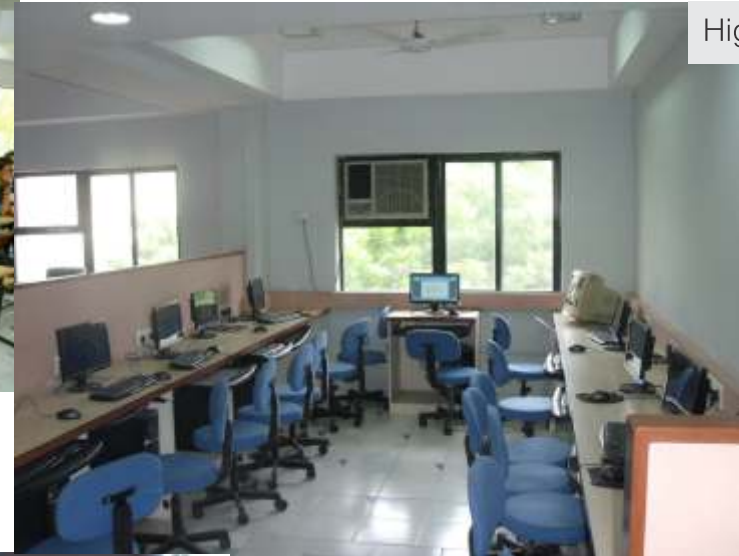
High Tech Computer Lab