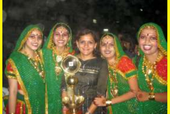
1st Prize in Garba competition organised by J.G.College of Commerce