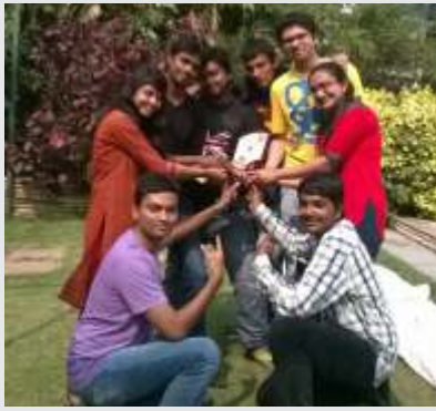
Students won the trophy in Business Plan at The Unassailable – a National Competition Carnival organized by Kadi Sarva Vishwavidyalaya