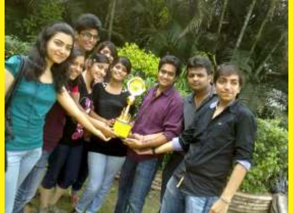
1st Runners-up trophy for the overall performance in Management Fest-Concourse organised by BKMIBA