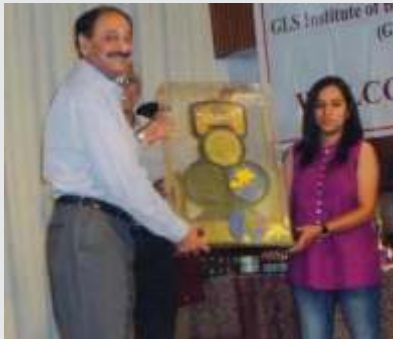
1st Prize in B.R.Shenoy Essay writing Competition