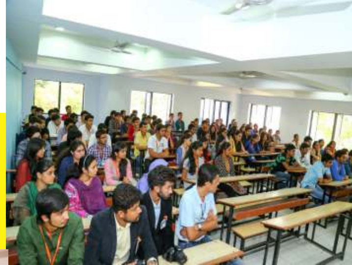
Spacious Class Room